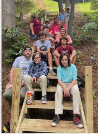
Summer Mission 2024 Team

This Sunday December 1st following the 10:30 service, in Ascension Hall.