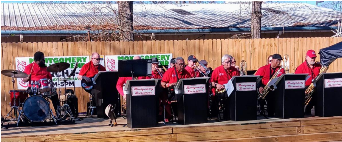
The Recreators Second and Fourth Tuesdays at 7pm Joshua Commons

In the months of August and September, The Recreators will be practicing in Joshua Commons. BYOBeverage and enjoy an evening of good music and fellowship. This is open to anyone who attends CoA, lives in the Garden District, or is friend of the congregation.