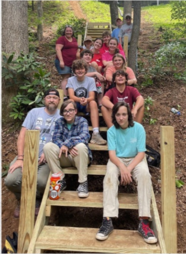
Summer Mission 2024 Team

Sunday, November 30th following the 10:30 service, in Ascension Hall.